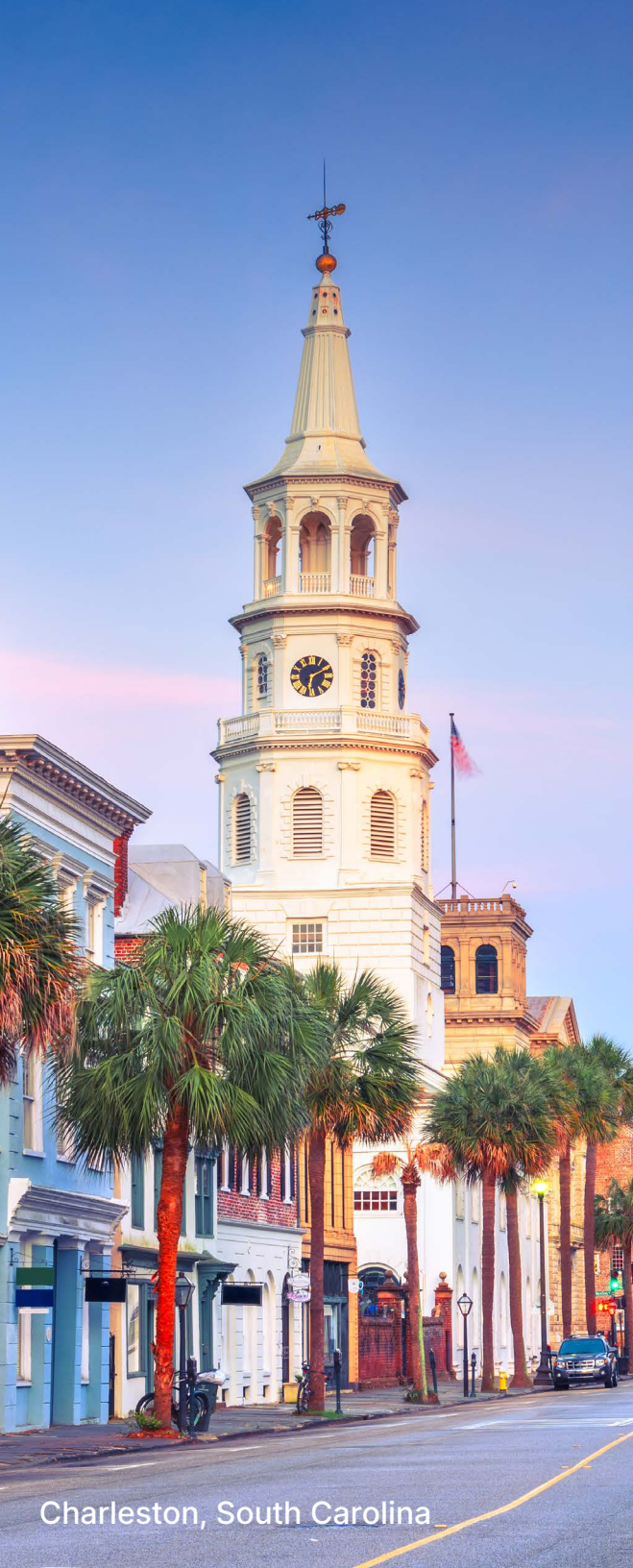
Charleston, South Carolina