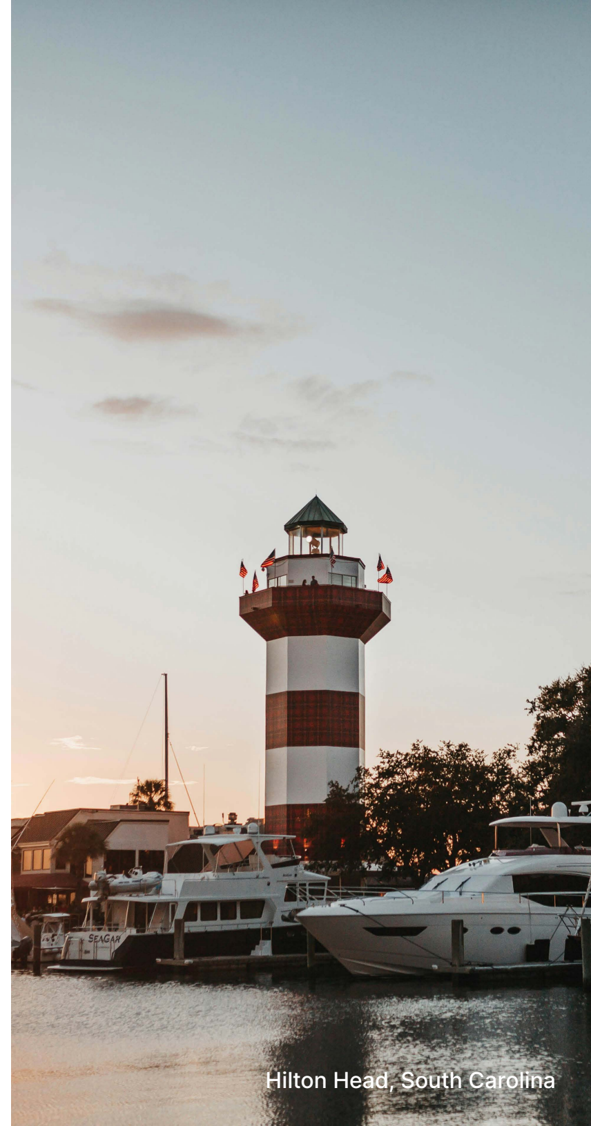
Hilton Head, South Carolina

Given the current backdrop, we believe the best way to navigate all the uncertainties facing the economy while still benefiting from the strength in AI adoption is through diversified portfolios that meet long-term investment objectives. If concerns remain, however, you should speak to your financial advisor to go over your financial plans.