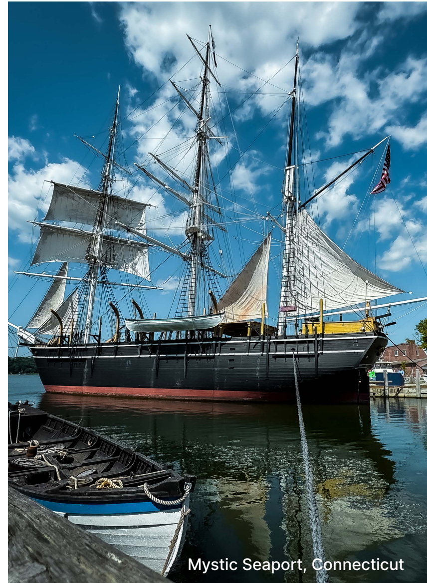
Mystic Seaport, Connecticut

While March served as a reminder that risks can shift suddenly for markets, the long-term outlook remains positive. We can, however, expect challenges and periods of volatility along the way. Given the potential for further market swings, a well-diversified portfolio that takes into account investor goals and timelines remains the best path forward for most. If concerns remain, however, you should speak to your financial advisor to go over your financial plans.