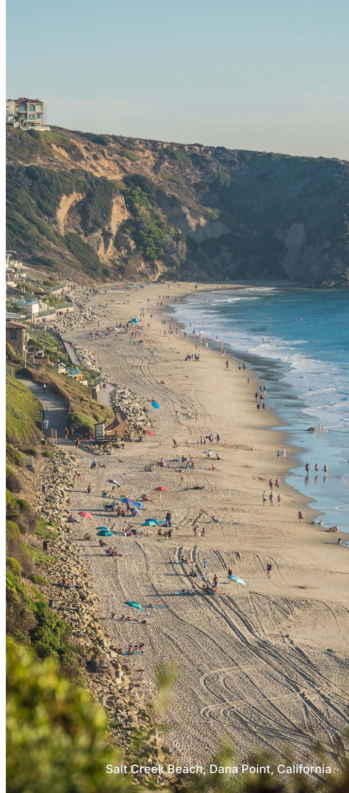
Salt Creek Beach, Dana Point, California

While March served as a reminder that risks can shift suddenly for markets, the long-term outlook remains solid due to the healthy fundamentals. Given the potential for further short-term disruptions, a well-diversified portfolio that matches investor goals and risk tolerance remains the best path forward for most. If concerns remain, you should speak with your financial advisor to go over your financial plans.