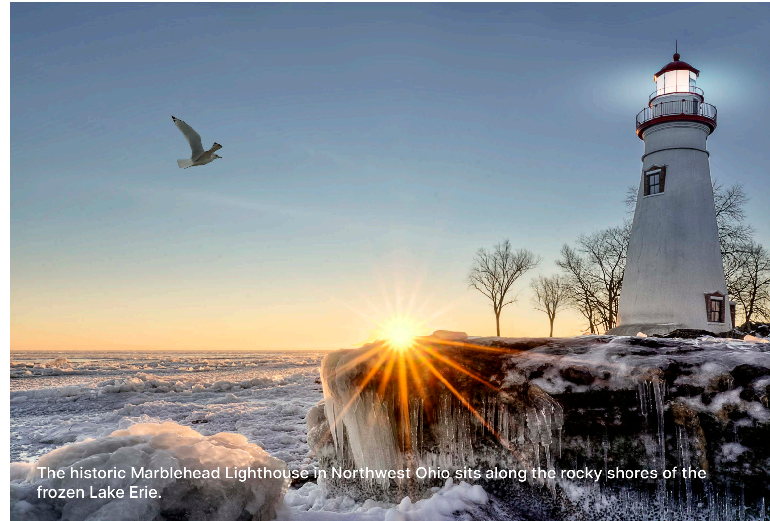
The historic Marblehead Lighthouse in Northwest Ohio sits along the rocky shores of the frozen Lake Erie.