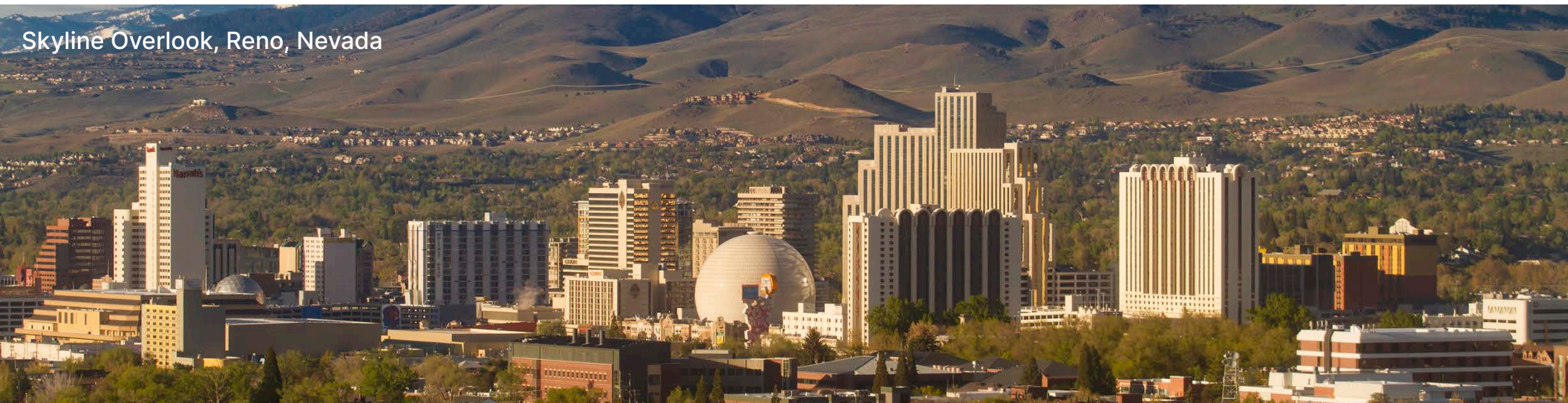
Skyline Overlook, Reno, Nevada