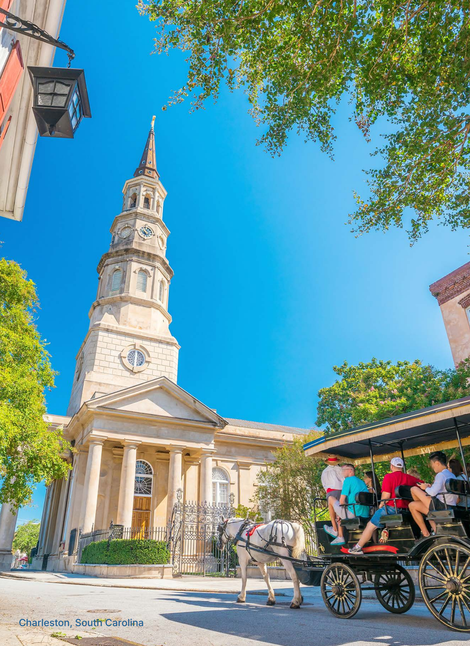
Charleston, South Carolina