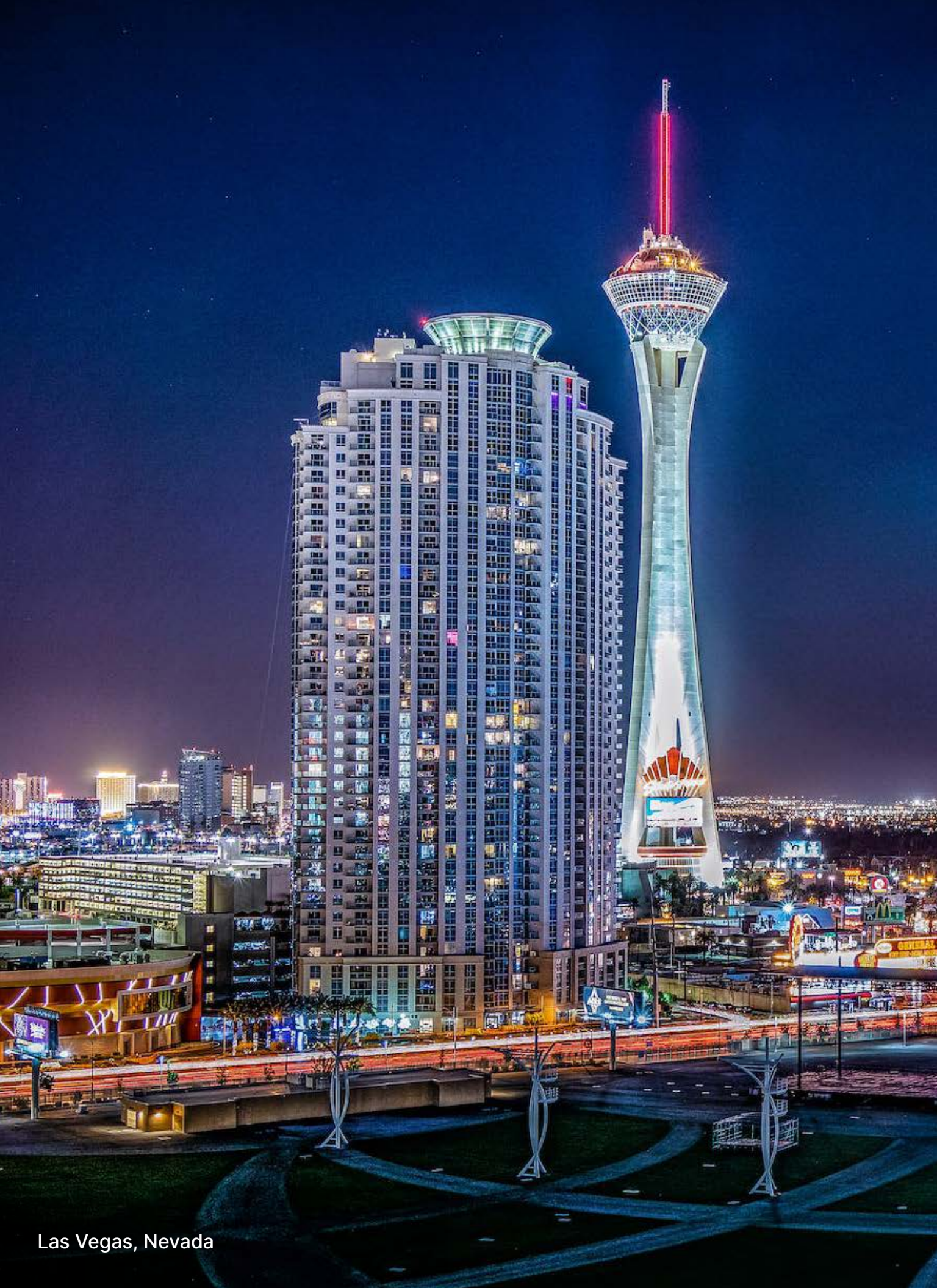
Las Vegas, Nevada