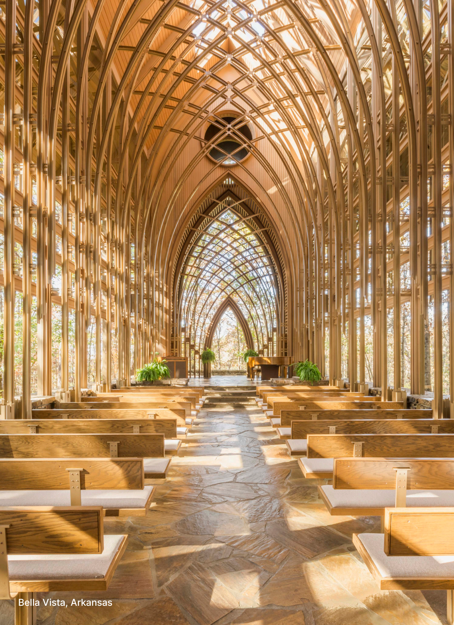
Bella Vista, Arkansas